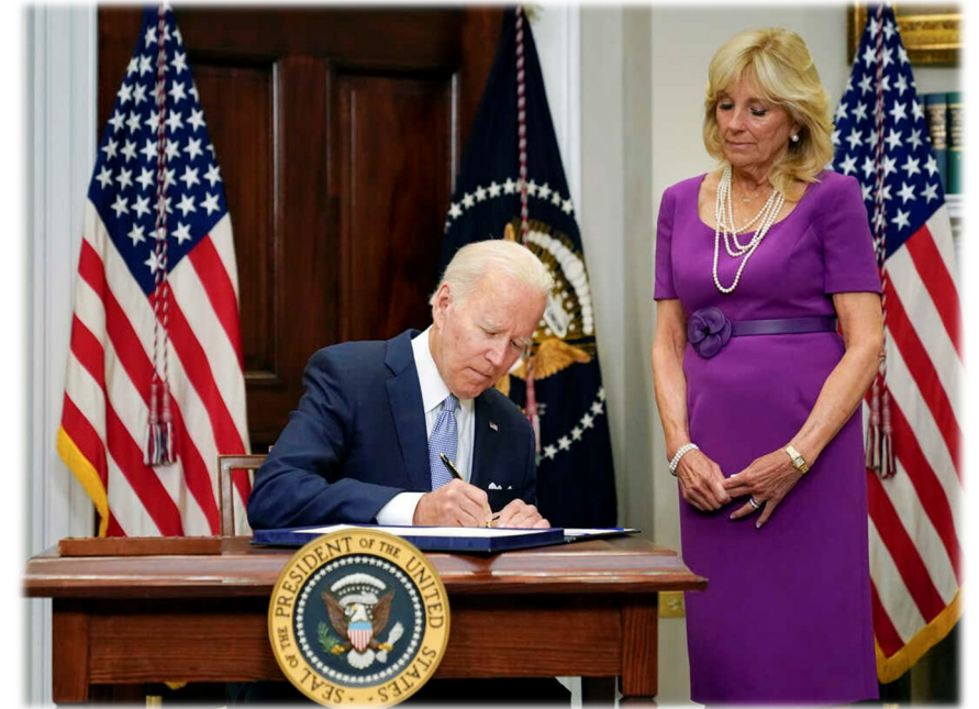
President Biden signs into law the Bipartisan Safer Communities Act gun safety bill.